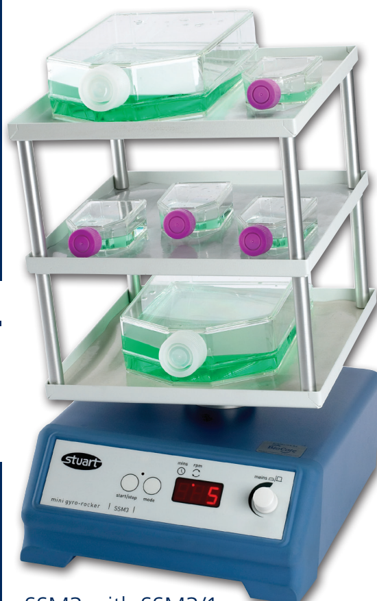
SSM3 with SSM3/1